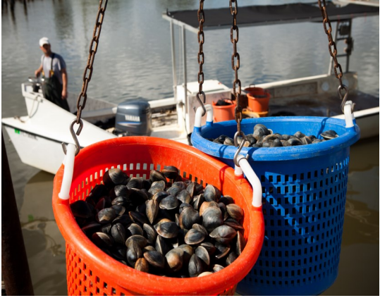
Clam Harvesting in Cedar Key, FL

Day One: First STOP- CEDAR KEY in Levy County, Florida. This beautiful island is located in the Gulf of Mexico, just west of Gainesville, Florida. Come prepared to be immersed in the local culture of a working waterfront for oystermen and clam farmers. Wander the narrow street, rich in history and architecture, circa 1850's. Today, there is a booming business of raising clams and oysters just off shore. There are many "Farm to Table" restaurants serving delectable and savory dishes. Take a educational and fun clam tour with Scale Key Clam Tours 352-221-2555. Many restaurants on the island feature local clams, oysters, crabs and amazing World Champion Clam Chowder at Tony's Seafood Restaurant.